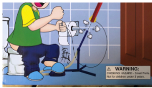
Missing your sports fix? Here's something that you can play even under quarantine.

the contest. They can be more than one line, but don't write a whole scene or anything. You can find the whole oeuvre online at opensource-shakespeare.org .